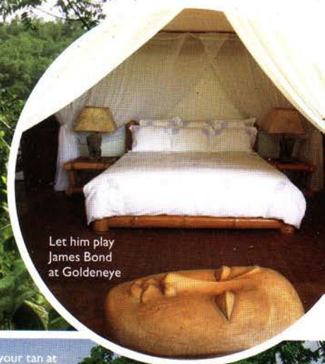
Let him play James Bond at Goldeneye