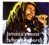
Jamaica's most famous export

Jamaica is packed with exciting honeymoon experiences. How about a canopy tour of the rainforest or mountain-biking through the Blue Mountains (top); a coffee plantation visit or a walk up the dramatic Dunn's River Falls ? There's horse riding in the surf on the beach, swimming with dolphins and visiting Noël Coward's former home, the splendid Firefly. Jamaica is also synonymous with music, in particular reggae. From the moment you touch down until the moment you leave, your honeymoon will have a background track of island beats , from roadside café stereos to steel drum bands in swish hotels. After all, this is the birthplace of Bob Marley (above) – there's