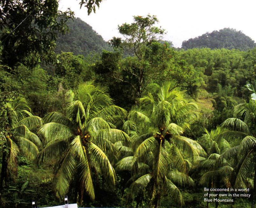
Be cocooned in a world of your own in the misty Blue Mountains