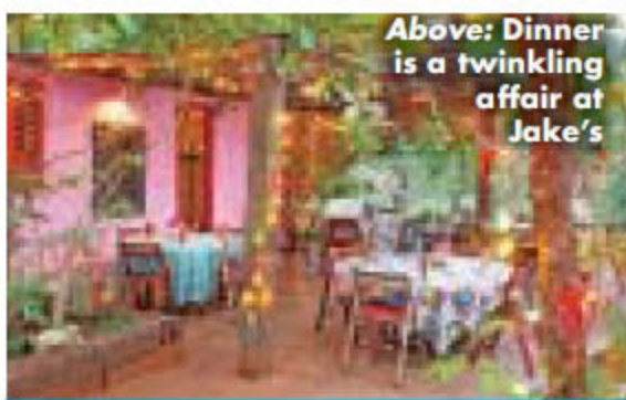
Above: Dinner is a twinkling affair at Jake's