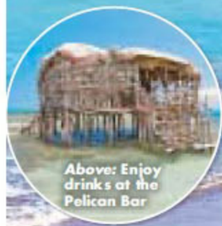
Above: Enjoy drinks at the Pelican Bar