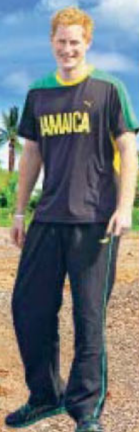
Main: A beautiful beach in Jamaica and, right: Prince Harry who visited the island recently