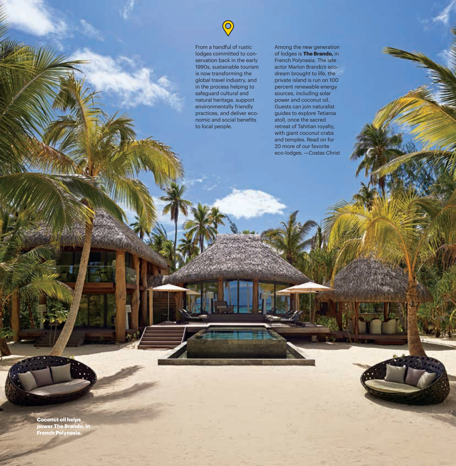
Coconut oil helps power The Brando, in French Polynesia.

Among the new generation of lodges is The Brando , in French Polynesia. The late actor Marlon Brando's eco-dream brought to life, the private island is run on 100 percent renewable energy sources, including solar power and coconut oil. Guests can join naturalist guides to explore Tetiaroa atoll, once the sacred retreat of Tahitian royalty, with giant coconut crabs and temples. Read on for 20 more of our favorite eco-lodges. —Costas Christ