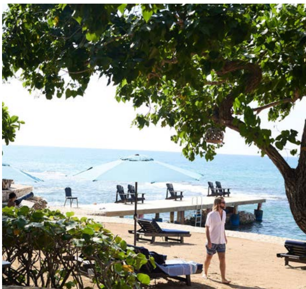
JAKES BEACH & DOCK

JAKES PROPERTY FEATURES A PRIVATE BEACH, POPULAR HOTSPOTS JACK SPRAT & JAKES RESTAURANT, DOUGIES BAR, DRIFTWOOD SPA & SEAWATA GIFT SHOP – ALL CUSTOM-DESIGNED WITH UNIQUE TOUCHES.