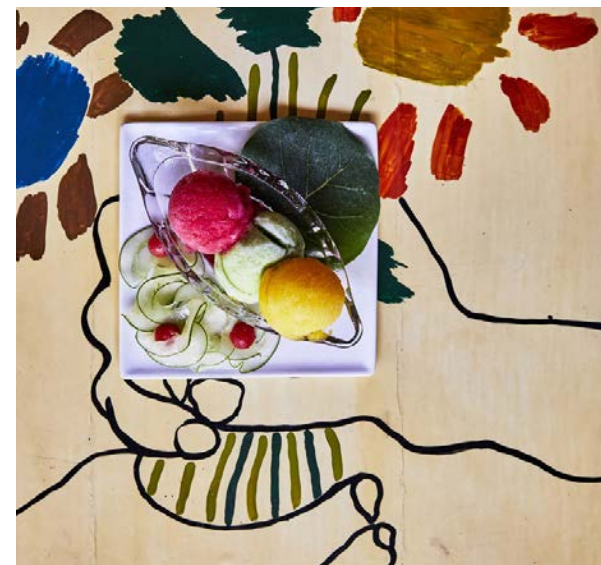
JAKES RESTAURANT DETAIL