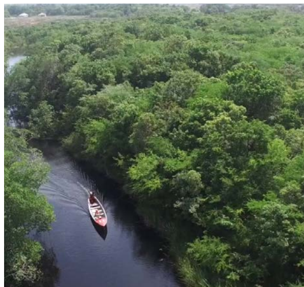
BLACK RIVER SAFARI