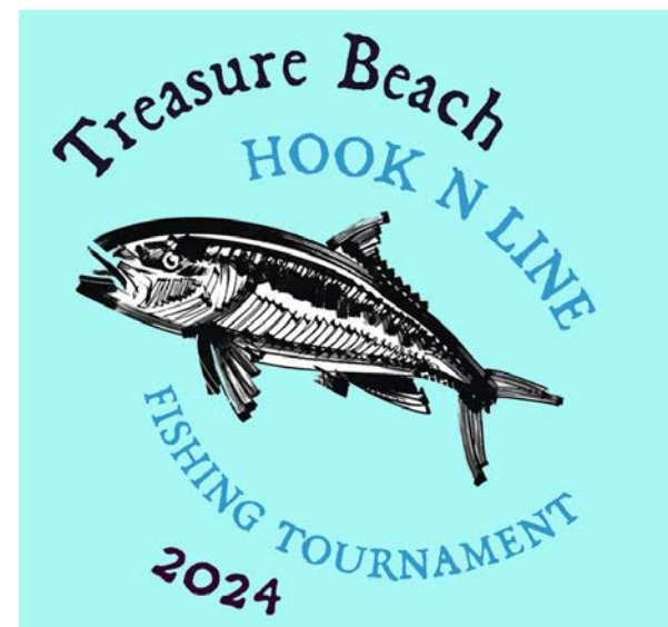
HEROES DAY HOOK N LINE TOURNAMENT