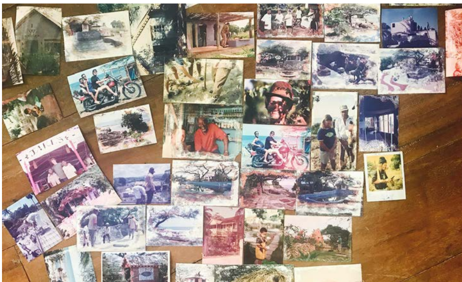
SNAPSHOTS SHOWCASING JAKES' LONG HISTORY