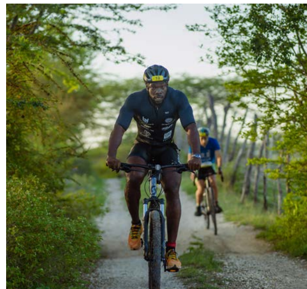
JAKES OFF-ROAD TRIATHLON