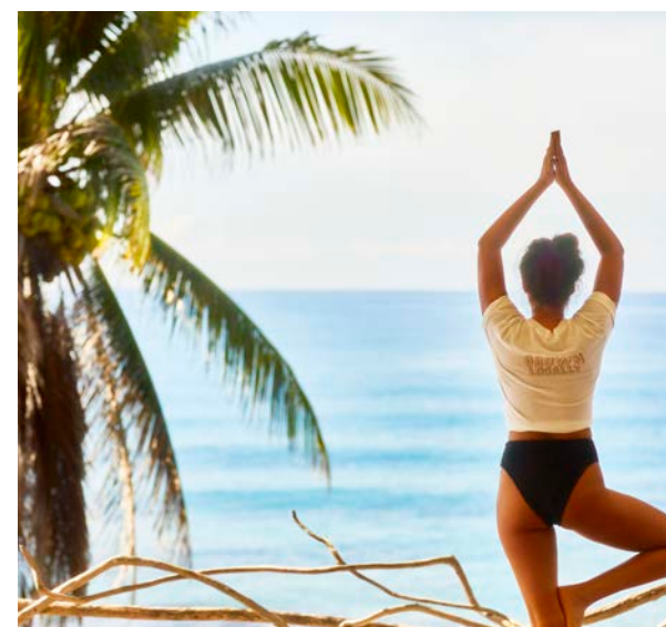
YOGA DECK @ DRIFTWOOD SPA