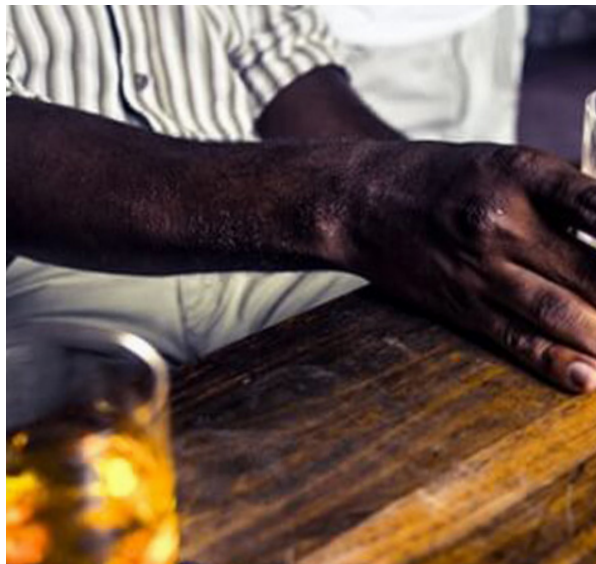
APPLETON RUM EXPERIENCE