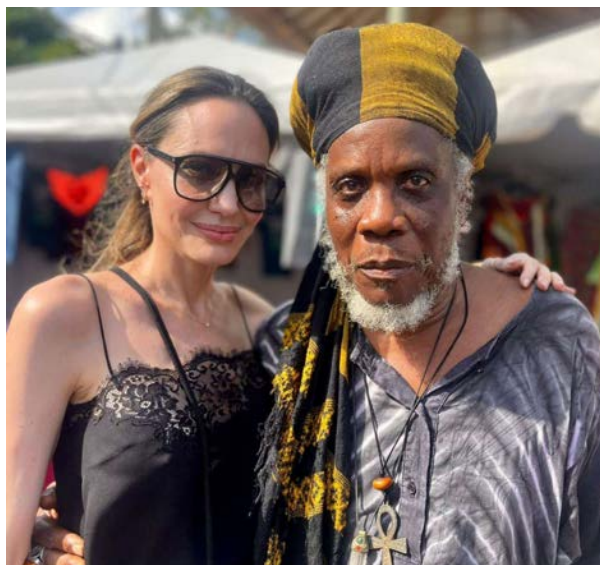
ANGELINA JOLIE AT CALABASH FESTIVAL

OUR ROBUST EVENT CALENDAR DRAWS GUESTS FROM ACROSS JAMAICA, EUROPE, NORTH & SOUTH AMERICA, AND THE CARIBBEAN — ALL LOOKING FOR UNIQUE & AUTHENTIC JAMAICAN EXPERIENCES.