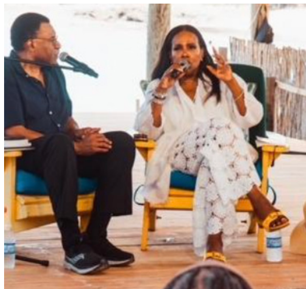
SHERYL LEE RALPH AT CALABASH FESTIVAL