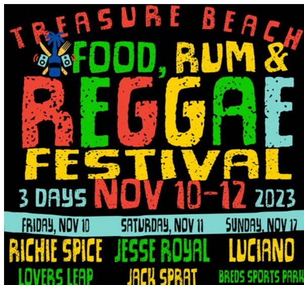
NEXT FOOD RUM & REGGAE FESTIVAL: NOV 7-9, 2025