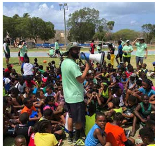
PHILADELPHIA MEN'S BASKETBALL LEAGUE AUG 10-14