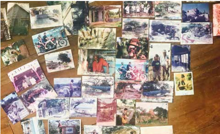
SNAPSHOTS SHOWCASING JAKES' LONG HISTORY