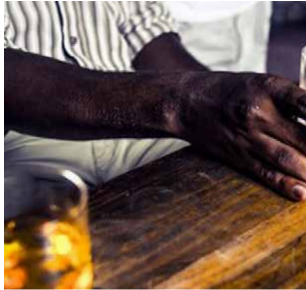
APPLETON RUM EXPERIENCE