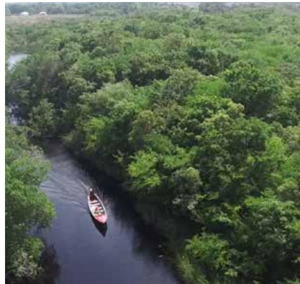
BLACK RIVER SAFARI