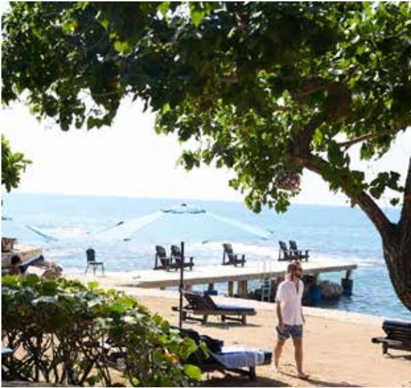
JAKES BEACH & DOCK

JAKES PROPERTY FEATURES A PRIVATE BEACH, POPULAR HOTSPOTS JACK SPRAT & JAKES RESTAURANT, DOUGIES BAR, DRIFTWOOD SPA & SEAWATA GIFT SHOP – ALL CUSTOM-DESIGNED WITH UNIQUE TOUCHES.