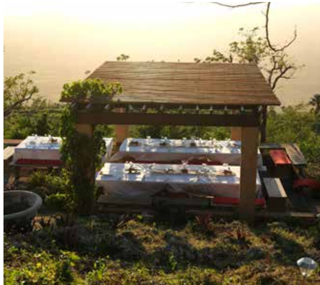
MONTHLY FULL MOON DINNERS