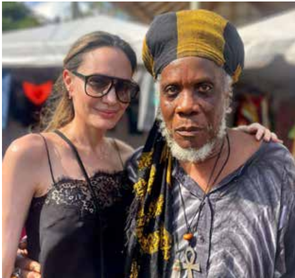
ANGELINA JOLIE AT THE BI-ANNUAL CALABASH FESTIVAL

OUR ROBUST EVENT CALENDAR DRAWS GUESTS FROM ACROSS JAMAICA, EUROPE, NORTH & SOUTH AMERICA, AND THE CARIBBEAN – ALL LOOKING FOR UNIQUE & AUTHENTIC JAMAIGAN EXPERIENCES.