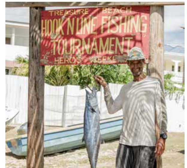
HEROES DAY HOOK N LINE TOURNAMENT OCT 17-19, 2026