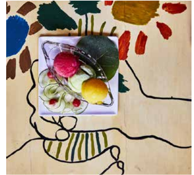
JAKES RESTAURANT DETAIL