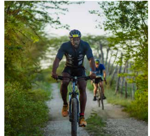
JAKES OFF-ROAD TRIATHLON